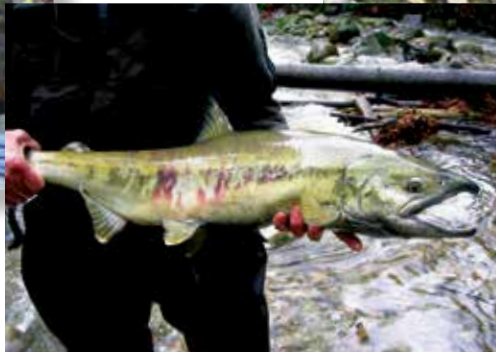
Chum Salmon found in Creek in BP's