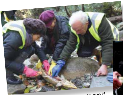
Examining dead chum salmon to see if the fish has spawned

Our survey findings are distributed to federal, provincial and municipal governments and to organizations, such as the Pacific Salmon Foundation. The survey data provides valuable insight into local salmon runs, information that would be difficult and expensive to gather if not for the efforts of volunteer Streamkeepers and students. Fisheries and Oceans Canada has endorsed the program, describing it as a unique partnership, bringing together good stewardship practices and education. Thanks to the efforts of student volunteers and Streamkeepers, we can confirm that Brothers and Hadden Creeks remain the most productive salmon streams in West Vancouver. In Brothers Creek, for example, each year we observe up to 1,000 chum, around 100 coho and as many as 2,000 pinks, which return every other year ( www.westvancouverstreamkeepers.ca ).