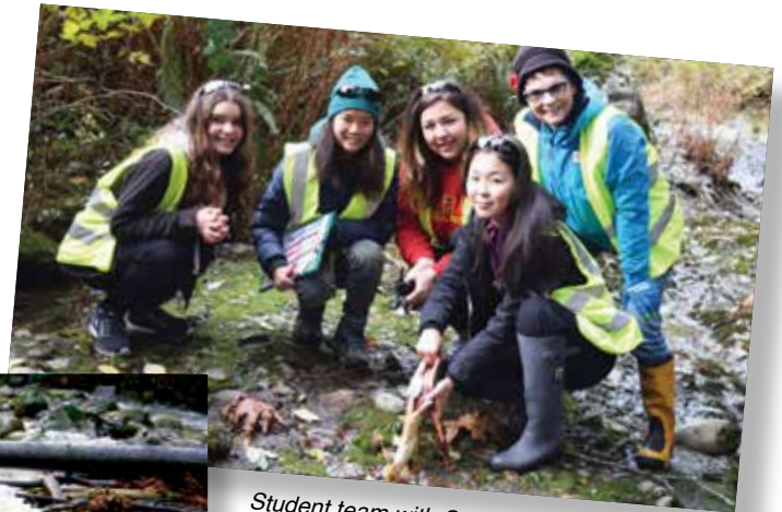
Student team with Streamkeeper member