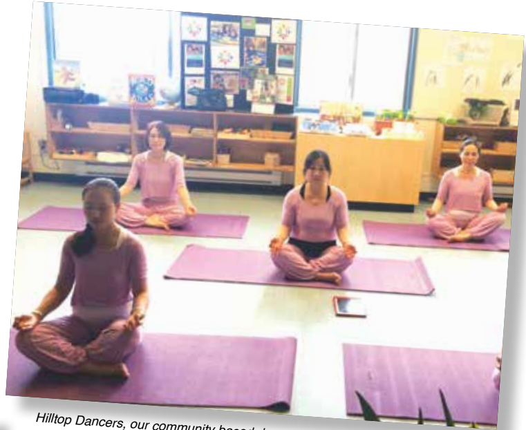
Hilltop Dancers, our community based dance group, perform yoga dance.

For more information go to the West Vancouver Schools website: westvancouver.schools.ca and look under "Programs". Or simply come and visit The Hub! It's located in the portable at the back of Chartwell School.