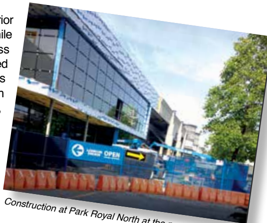
Construction at Park Royal North at the new Loblaw's site.

Along with the addition of the two-level Simons, Canada's iconic fashion department store, opening soon in Park Royal South and The Village will be Oak + Fort, a fashion retailer based out of Vancouver, and the Keg Restaurant will be returning, adding a popular option to the dining experience. Over at Park Royal North, we are looking forward to the convenience of having a grocery store on site once again. The new Loblaw's City Market and Steve Nash Fitness are both expected to open in early Fall 2016.