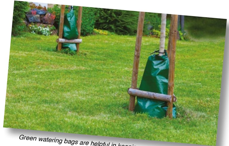
Green watering bags are helpful in keeping your trees hydrated during prolonged dry periods.

If you had warned your neighbour about your concerns with their tree and they had not taken any steps to deal with the tree that might