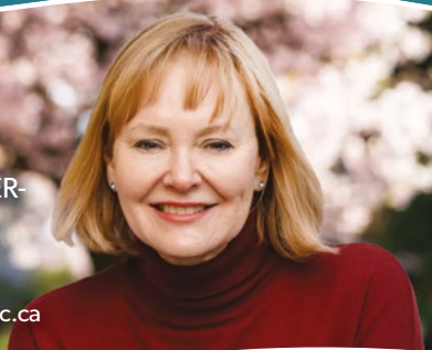
A message from your local MLA